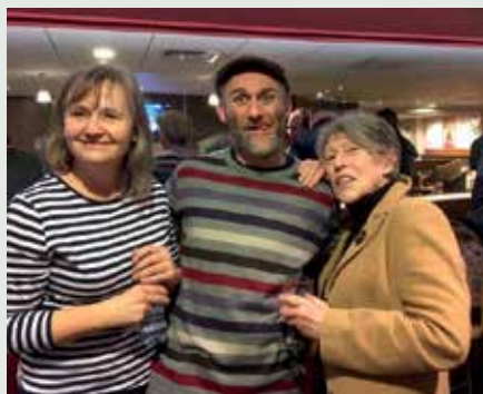
Waiting for Godot Meet the Cast Party

This summer we shall again be giving £1,000 from the ETA's funds towards bursaries which will enable young people to take part in the Everyman Summer School – a worthwhile use of our funds, we feel. We are also pleased when the BTEC Performing Arts students come to entertain us, and they always welcome the opportunity to perform. The production of their musical The Battle of Boat will take place on June 15th in Parabola Arts Centre. We wish them