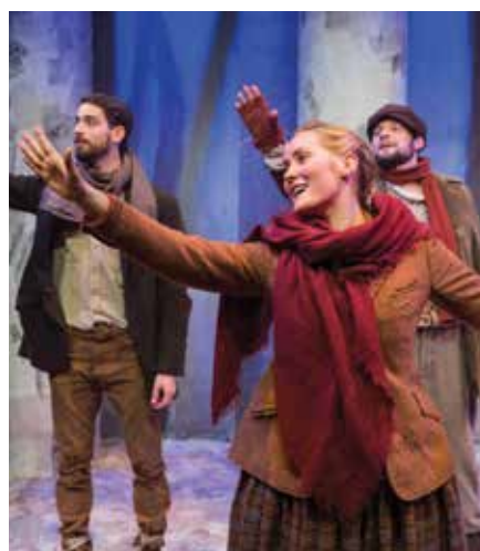
A Hammerpuzzle previous production.

Full details will be available on the ETA website or contact Janet Limb on 01242 237484.