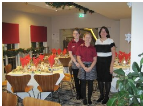
Catering staff at the Christmas dinner