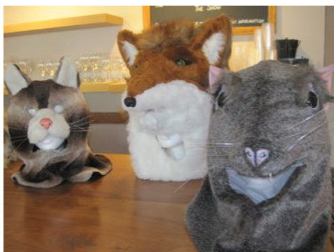
Costumes for The Tailor of Gloucester

See our e-mails, website, notice board, Facebook page and Twitter for up to date details.