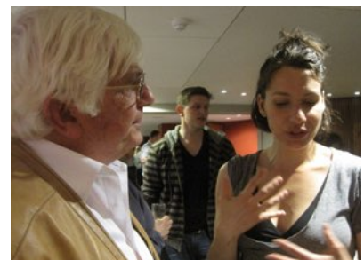
Meeting the cast of Theatre Témoin