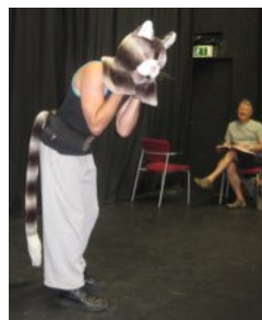
Simpkin, the cat, at the Open Rehearsal